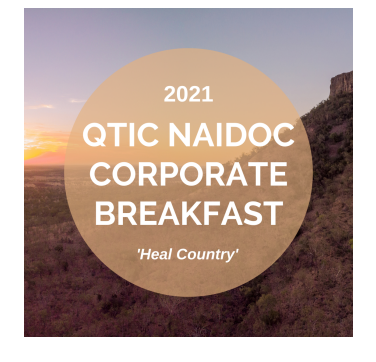
NAIDOC Corporate Breakfast

The Holiday Dollars program was launched in Cairns and the Great Barrier Reef in March 2021 and now extends to Brisbane and the Whitsundays. There are also plans to extend the program to the Gold Coast. The program has been designed to support those regions most impacted by the loss of international visitors. Tourism operators in these destinations